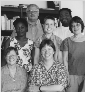
Nikhil Aziz absent from picture

We hope you enjoy – tell us what you think!